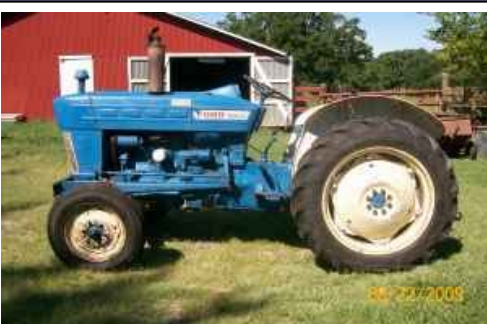
Tractor of similar make and model to the one owned by Mr. Fairbank.

The investigation took many turns, but it is unique to detectives in part because of the interesting resources that were used to search his property. Using forensic botanists to identify disturbed soil, metal detector club members, cadaver dogs, and a naturalist to study animal behavior and nesting activities that imply clandestine graves. Further, NecroSearch International used instruments commonly used in geophysics and geology to identify areas of disturbed soil. Because the property was disturbed by a nursery operation, useful data could only be collected from certain areas.