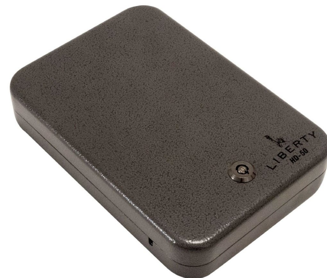
Liberty HD 50 Lockbox - $28