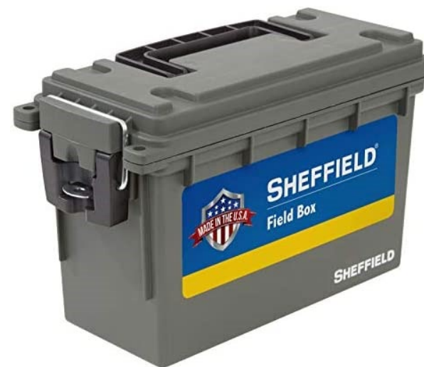
Sheffield Field Box - $8