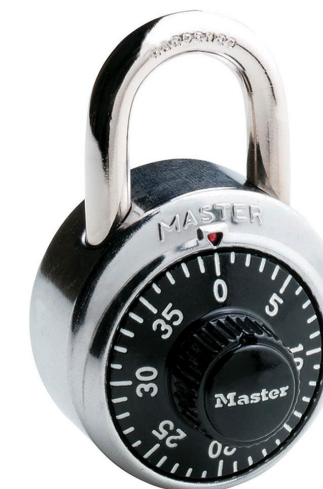
Masterlock Padlock - $5