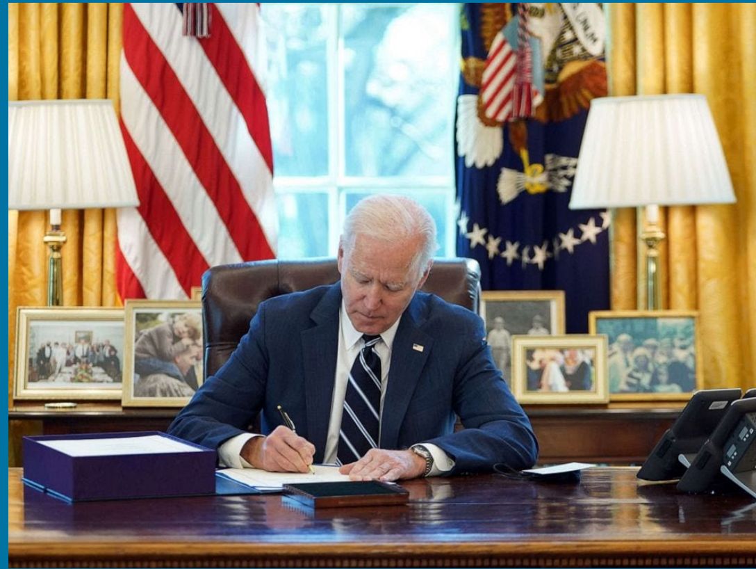
American Rescue Plan Act (ARPA)