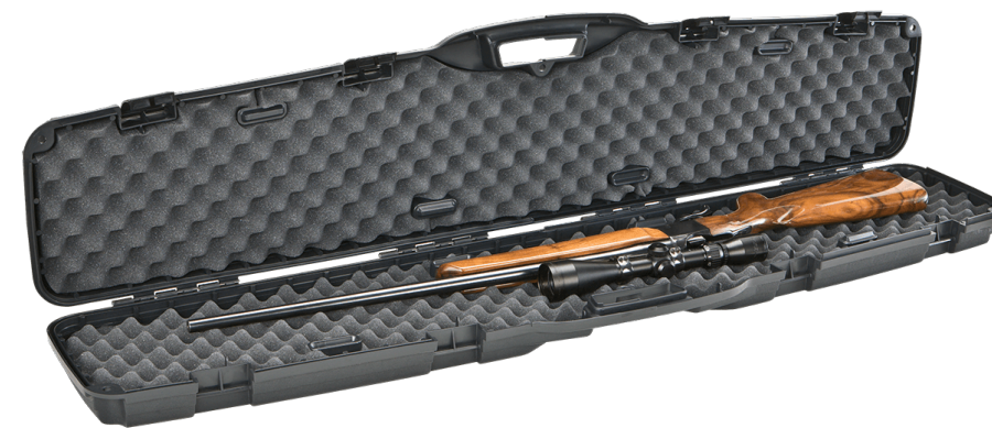
Plano Pro-Max Scoped Rifle Case - $41