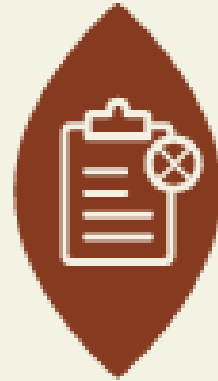
INVASIVE SPECIES MANAGEMENT