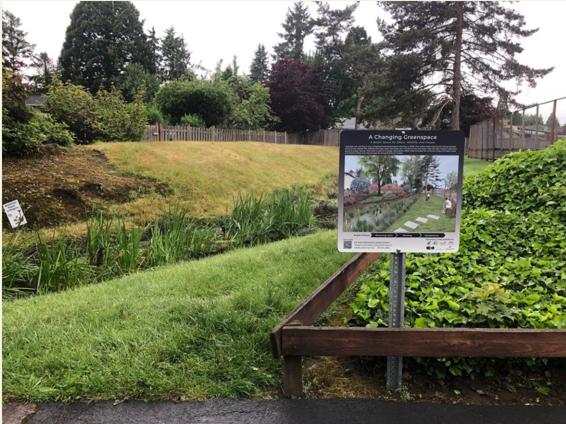
Butternut Creek Tributary