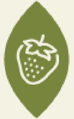
FOOD & FARMS