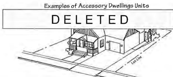
Figure 1.1 Attached Accessory Dwelling Unit - Single Story