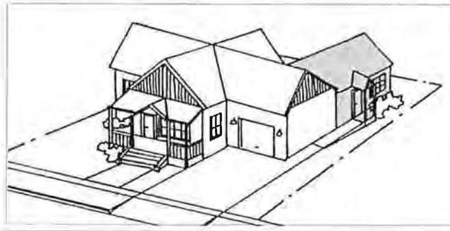
Section 106-6 Figure 2 – Attached (conversion of existing space)