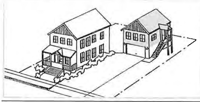
Section 106-6 Figure 3 – Detached (addition/conversion over detached garage)