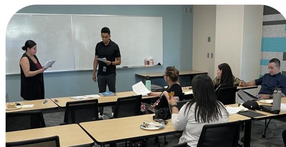
Staff role playing at the July 20, 2023 MI training.