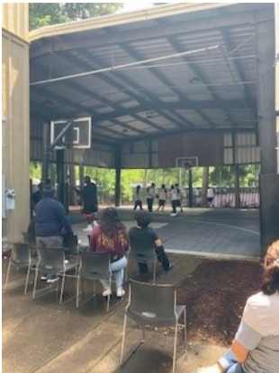
Playing basketball on Juneteenth