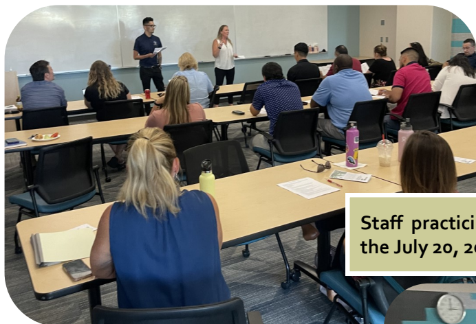
Staff practicing and learning valuable skills during the July 20, 2023 MI training