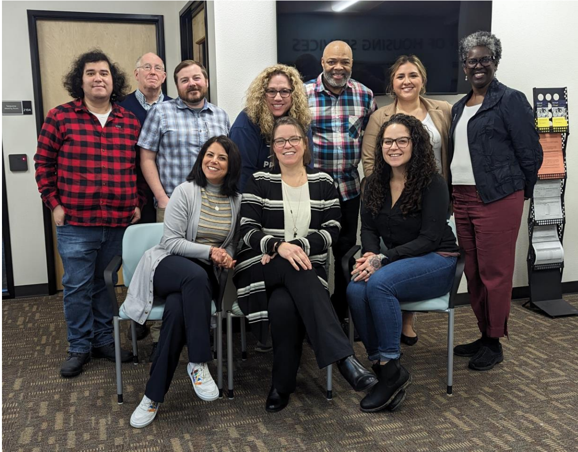
Members of the Solutions Council taken during their orientation meeting on Jan. 26, 2024.