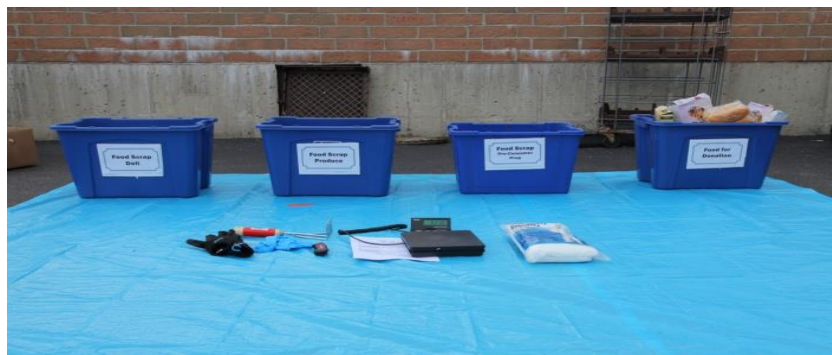
Figure 7. Place containers separated by waste category surrounding each table or across the tarp

The sorting area is designed around the inflow of waste to be sorted, and the outflow of the same waste after it is weighed. The following provides steps for setting up the sorting area.