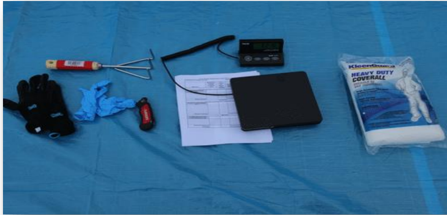
Figure 3. Supplies necessary to conduct the sort include a small portable scale, a small rake, tongs, and appropriate attire such as gloves and coveralls.