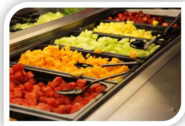
Figure 4. Observe and note the types of waste discovered at generation points.