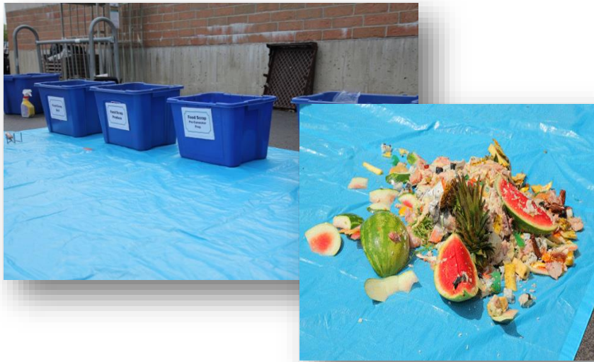
Figure 4. Set up sorting area by arranging tables with disposable table covers or a tarp on the ground. Arrange labeled bins for diverted material collection as planned (i.e. organics, metals, plastics, trash).