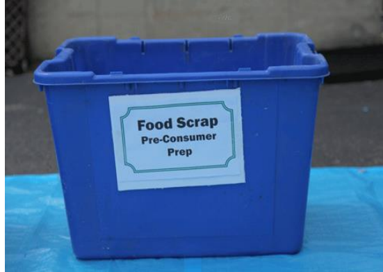
Figure 9. Label containers by the waste source and materials each will contain.