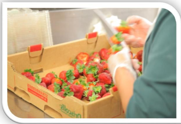
Figure 3. Identify locations on a facility tour which are generation points for food waste.

Definitions of the targeted wastes may be refined some after completing Step 2: The Pre-Assessment Questionnaire. For example, while completing the questionnaire you may learn that the compost hauler will not accept compostable plastics CPL#7. At which point you should revise your target waste definition and explore alternatives to compostable plastic that could be reused or recycled.