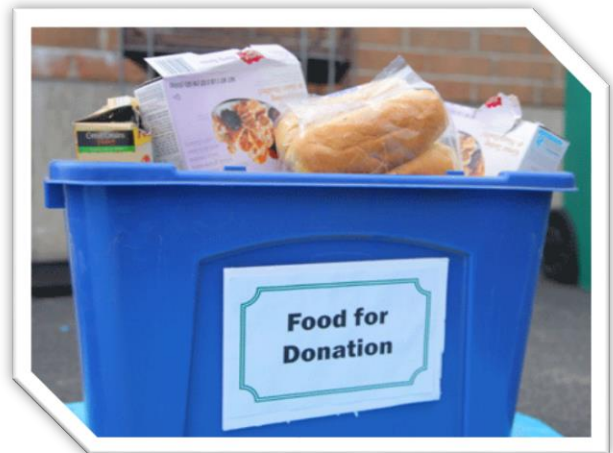
Figure 10. As each container is filled, it should be taken to the weigh station for weighing.