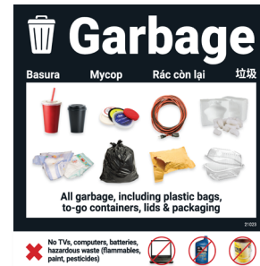
Garbage decal (10 x 10 inches)