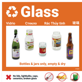
Glass recycling decal (10 x 10 inches)