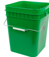
Food waste bucket 4-gallon (9.75" L x 9.75" W x 13" H)