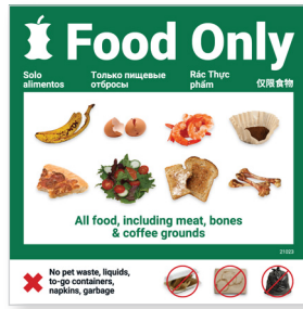
Food only decal with images (10 x 10 inches)