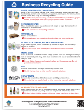
Business recycling guide (8.5 x 11 inches)