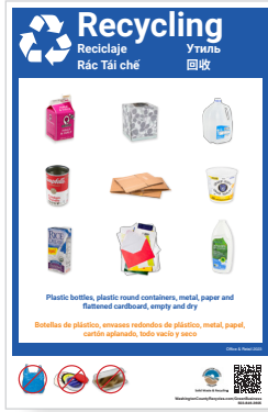
Recycling poster (11 x 17 inches)

To request assistance or resources, email recycle@washingtoncountyor.gov or call 503-846-3605.