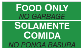
Food only decal text only (6.5 x 11 inches)