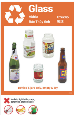
Glass recycling poster (11 x 17 inches)