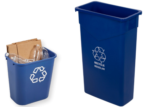
Recycling bin 7-gallon (14" L x 10" W x 15" H)