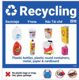
Recycling decal (10 x 10 inches)