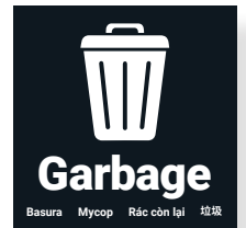
Garbage decal (6 x 6 inches)