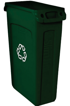
Food waste bin 23-gallon (22" L x 11" W x 30" H)