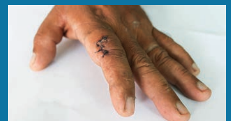
Unprotected & Infected Wounds