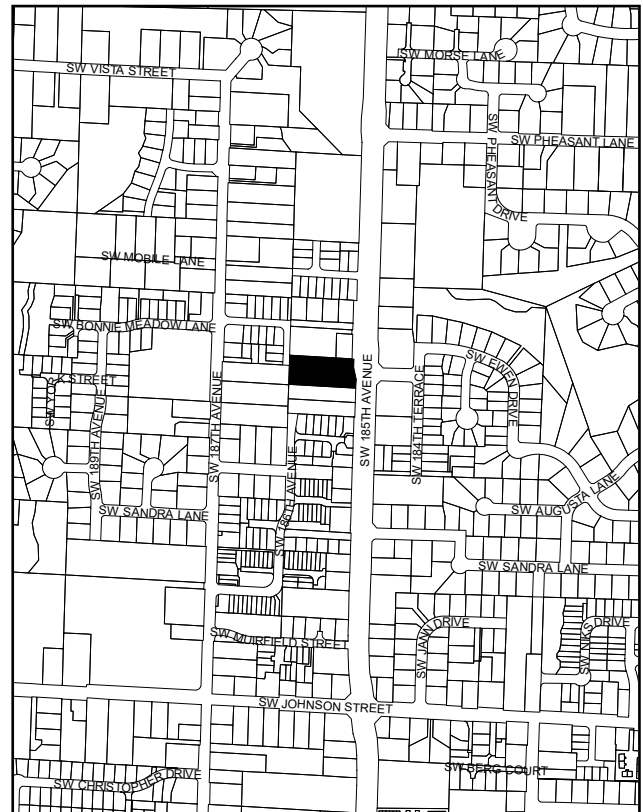
AREA MAP WITH SUBJECT PROPERTY ↓

Notice to Mortgagee, Lien Holder, Vendor or Seller: ORS Chapter 215 requires if you receive this notice it must promptly be forwarded to the purchaser.