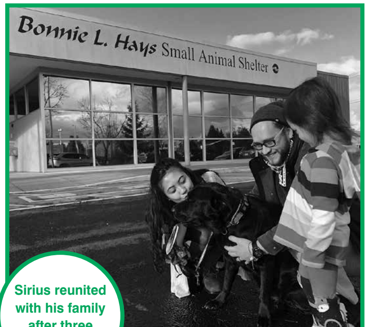
Sirius reunited with his family after three months apart!

As it turns out, Sirius's family had updated his microchip information immediately after he went missing from their home back in early September, when their gate had blown open during the windstorms and accompanying wildfires in the region. The family looked for Sirius, filed a lost dog report in Multnomah County where they live, and posted all over the internet and in their neighborhood in search of their family member. The family did not expect to be making the drive to Hillsboro to pick up their dog who'd gone missing in Portland. The owner shared with us that Sirius had been with her through a lot of stressful situations since his adoption four years earlier, including being a huge source of support for her when she got married and during her pregnancy and the birth of her daughter. This reunion warmed our hearts! If you find a stray pet, please notify your local animal shelter immediately and file a found report. You could be the key to helping an animal get back home to their family quickly!